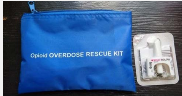
SEP 18 CPN Hosts Prevention Point Overdose Reversal Training