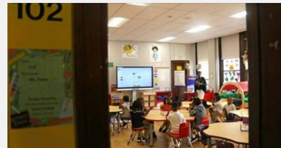
FEB 26 Board of Education Information Session + CPN Board Meeting