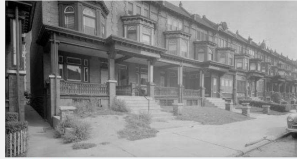
THU, OCT 4 AT 6:30 PM Free Neighborhood Will & Estate Planning Workshop Calvary Center for Culture and Community - Philadelphia, PA

3 rd Monday in April is Annual Meeting for all members and our Board Elections. We present activities of past year, review current year budget (approx. $33K), and vote on all Executive Board positions plus open At-Large Board positions. Typically features a special community presentation of note (i.e. candidates debate for local office)