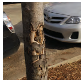
Young trees need our tender loving care.