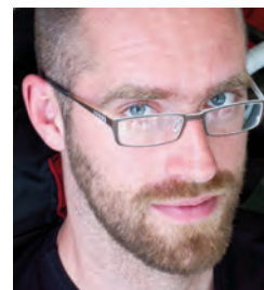
49XX Pentridge